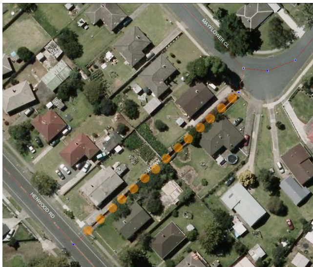
Figure 3 A new access way

A complete review of pedestrian access ways was carried out which resulted in the addition of 6070 (or 66km) of new access ways being added. This will greatly improve pedestrian navigation applications.